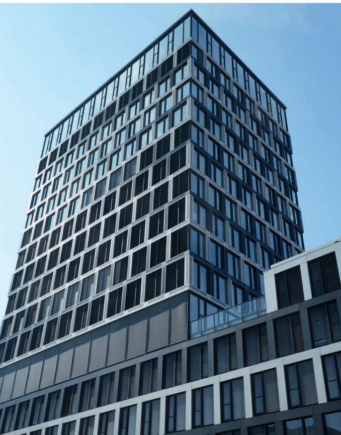
Tower podium building interface