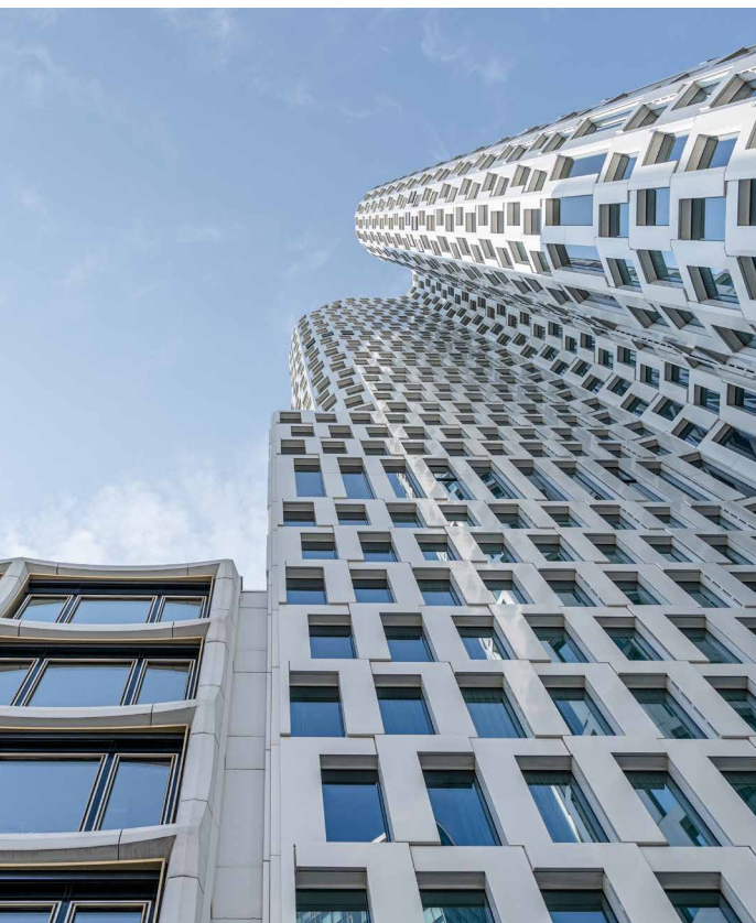
High- and low-rise building